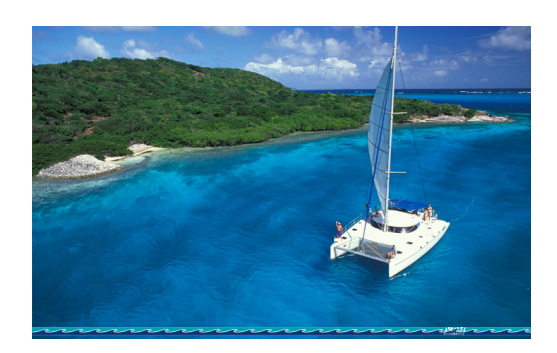
Day 3: St. Barth

On the way to Île Fourchue there will be a stop at "Colombier Cave", one of the most beautiful beaches of St Barth. You will here get the chance of indulging in a variety of watersport activities. Île Fourche is a magical and very quiet place to anchor for today's evening.