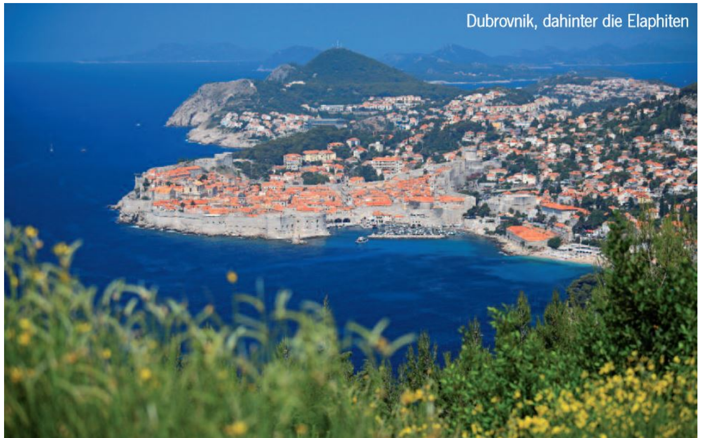
Dubrovnik, dahinter die Elaphiten