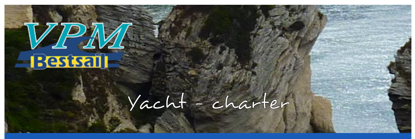
Yachtcharter Itineraries Corsica Ajaccio - Baie d Acciolu